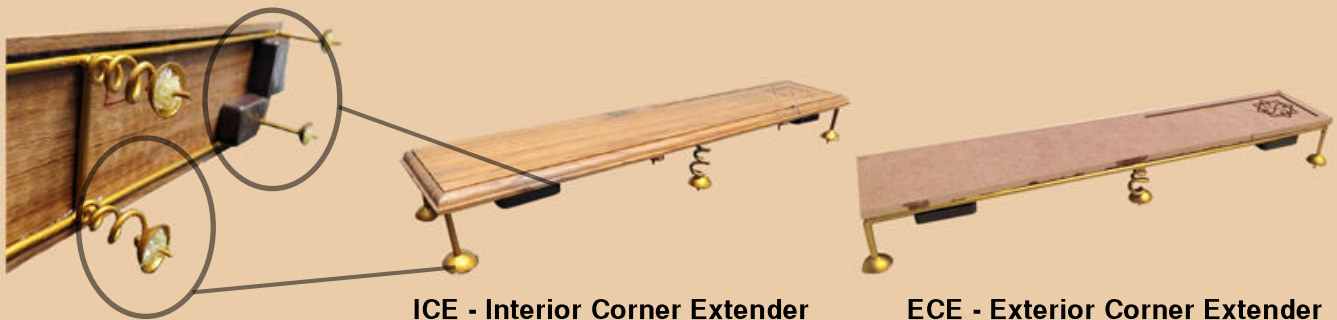
ICE - Interior Corner Extender